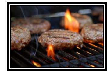
Georgetown's best Hamburger